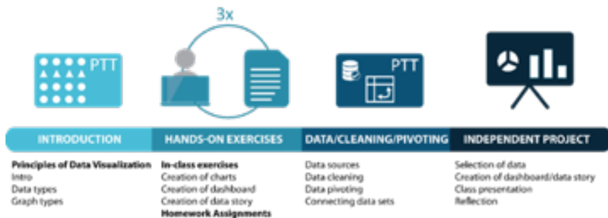
Figure 2 Learning timeline for the data analysis and data visualization component of the course.