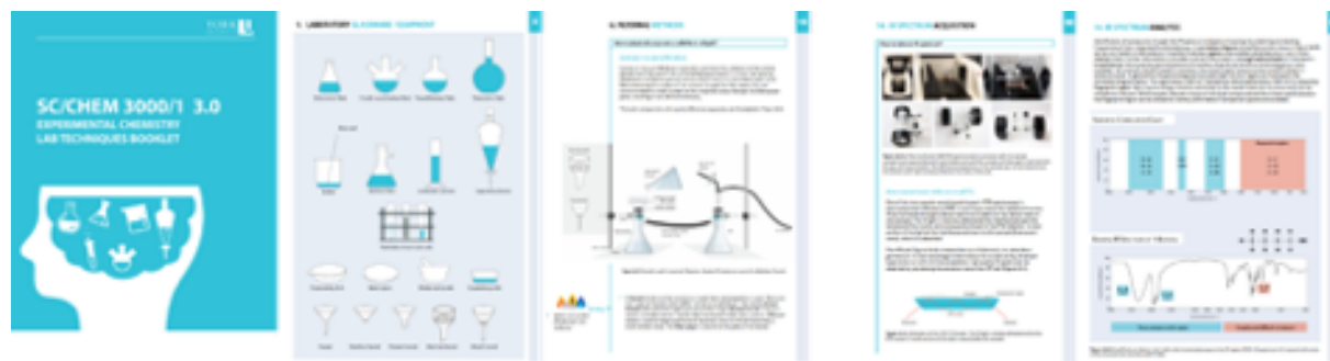
Figure 3 Layout and content snapshots of the "Experimental Chemistry Lab Techniques Booklet".

One of the resources created is the 60-page - "Experimental Chemistry Lab Techniques Booklet", which has been specifically designed for CHEM 3000/1 students as it details all the lab techniques that are used across the labs in those two courses, providing students with a background on specific glassware, details on apparatuses and spectrometers, and why and how certain techniques are used, while also highlighting safety considerations. The screenshots of the typical content and layout of the booklet are shown in Figure 3. The booklet has been designed as a reference resource and students are encouraged to use it before labs in conjunction with short videos that are provided on eClass (at this point from other sources, but in the future, we plan to create our own). In 2021, when this booklet was created, we coupled it to an orientation lab (mandatory, but not graded) which was designed as a scavenger hunt where students had to perform some of the steps of key techniques utilized in CHEM 3000/1. Students had handouts which they had to fill out based on the information in the booklet and the in-lab exercises that they performed. The idea was to allow students to familiarize themselves with the lab and equipment without the added pressure of grades or performance which are typically associated with regular lab sessions.