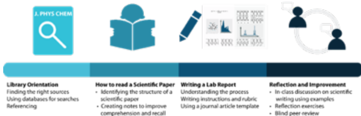
Figure 1 Exercises that have been introduced into CHEM 3000/1 that focus on developing scientific writing .